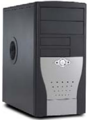
PC30322 mATX Tower with FPIO USB 2.0, audio