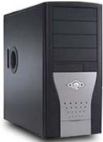
PC61122 ATX Mid-tower with FPIO USB 2.0, audio

S-Q6600: Asus P5K-PRE/WF, Core™ 2 Quad Q6600, 3GB DDR2-667 (3x 1GB), 500GB HD, 4X Blu-Ray™ BD-ROM, 20X DVDRW DL, Card Reader, GeForce 8600GT Silent 512MB PCIe X16 Graphics, PC61122, Microsoft Black Value Pack Desktop 2.0, Onboard Wi-Fi, 400W