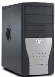
PC30322 mATX Tower with FPIO USB 2.0, audio

G-E4600-A: Asus P5K-VM, Core™ 2 Duo E4600, 1GB DDR2-667, 320GB HD, 20X DVDRW DL, Card Reader, Onboard Graphics, PC61122, Microsoft Wired Keyboard 500 & Wheel Optical Mouse, 400W