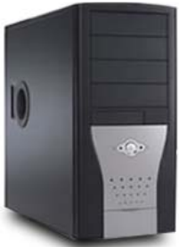
PC61122 ATX Mid-tower with FPIO USB 2.0, audio